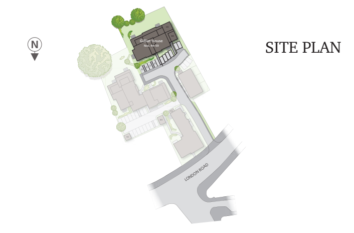
This site plan is a guide for illustrative purposes only. Landscaping shown is indicative only.