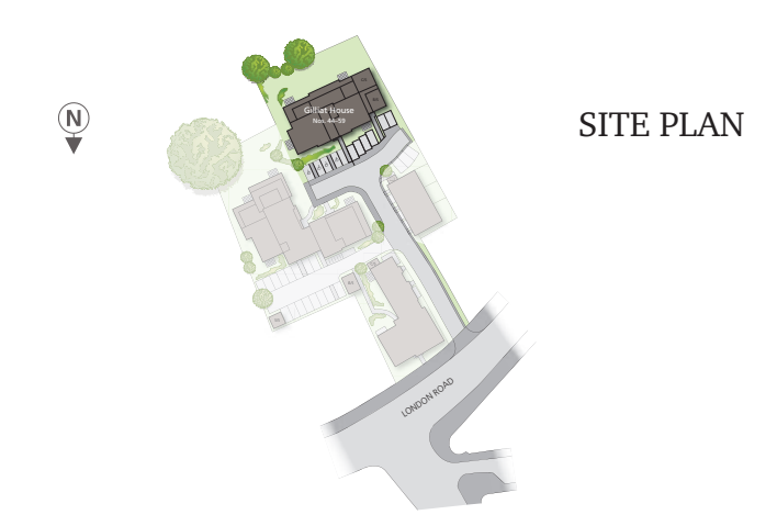
This site plan is a guide for illustrative purposes only. Landscaping shown is indicative only.